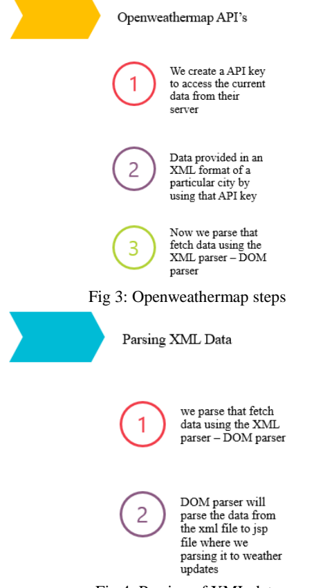
Fig 4: Parsing of XML data

The figures 3 and 4 show the implementation process.